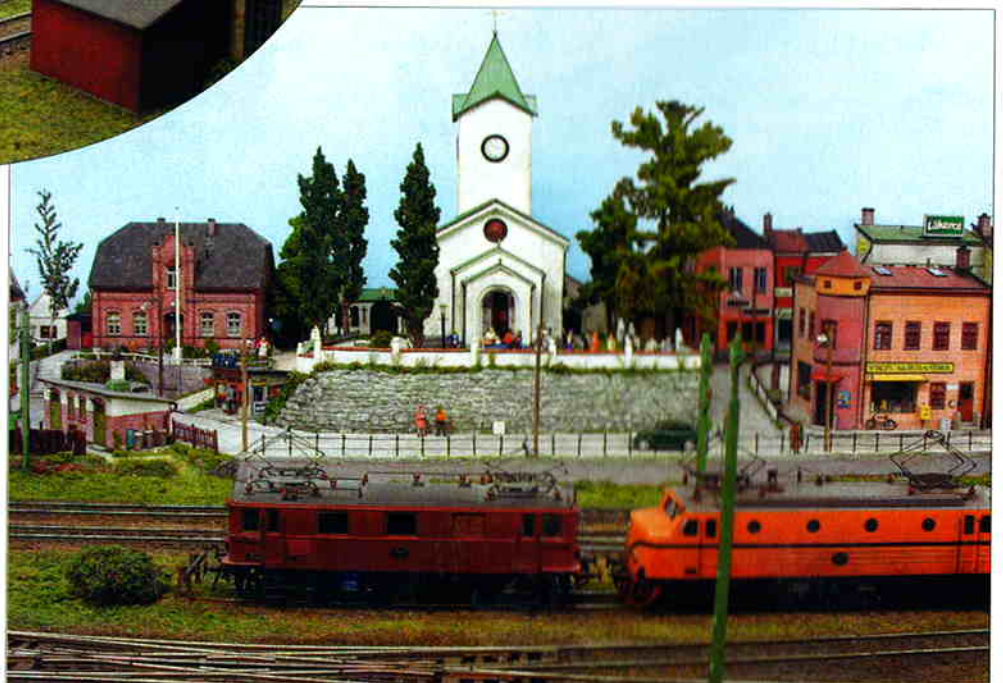
Right: two electric engines, on the left a D class and on the right the famous Ra class. The D class is a body kit from UGJ with a chassis from Brimalm and the Ra is a kit from Jeco.