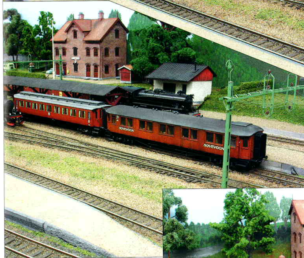
Above: the building in the background is the station. The two steam engines, classes E and E2, are from kits by Jeco.